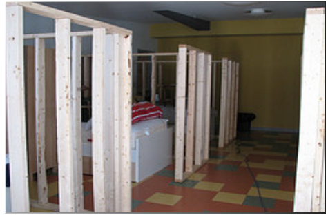
WORK IN PROGRESS: Ten days of volunteer labor created sleeping partitions—and dignifying privacy—for shelter residents.